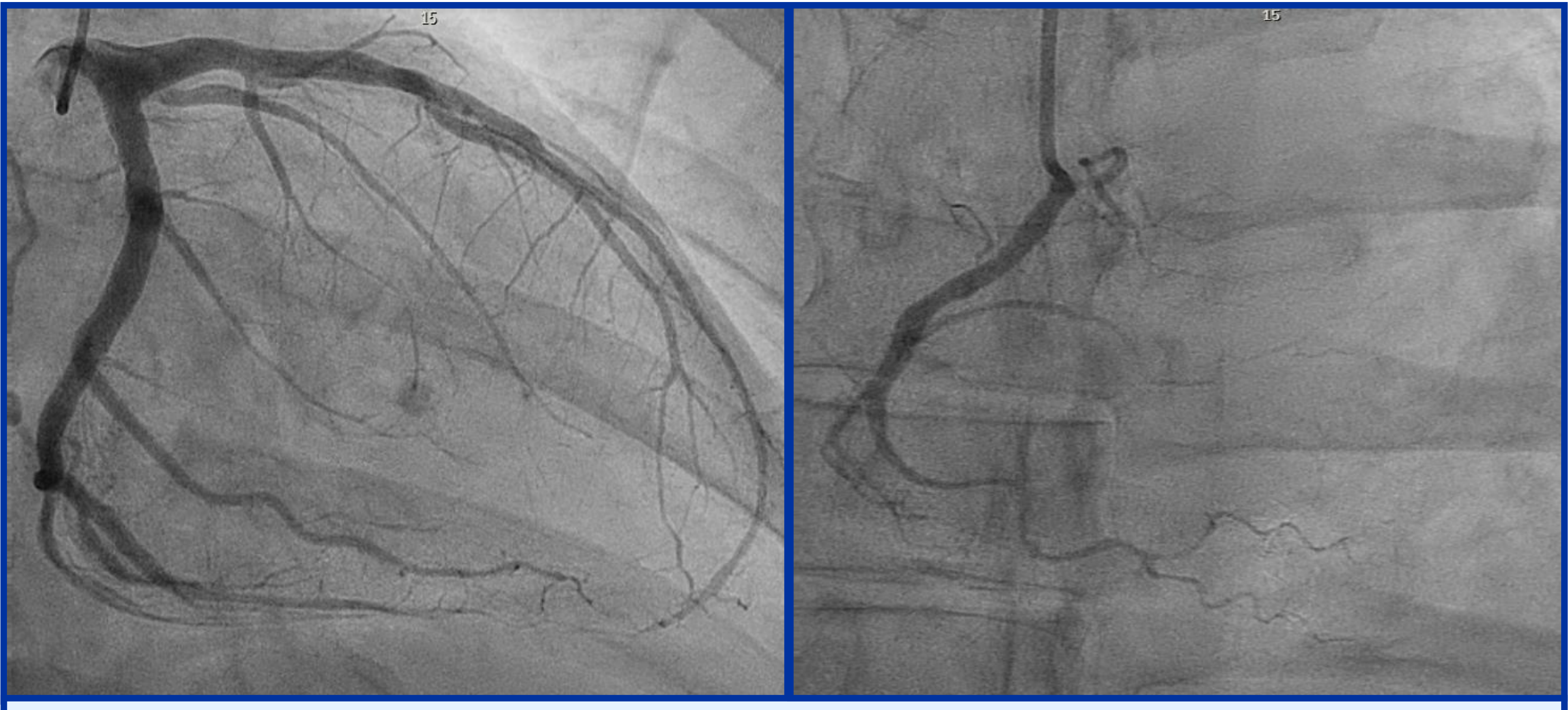
Fig. 2. Coronary Angiography. Catheterization demonstrated a left-dominant system with mild nonobstructive disease and no culprit lesion.